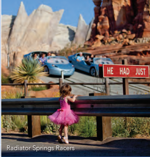
Radiator Springs Racers