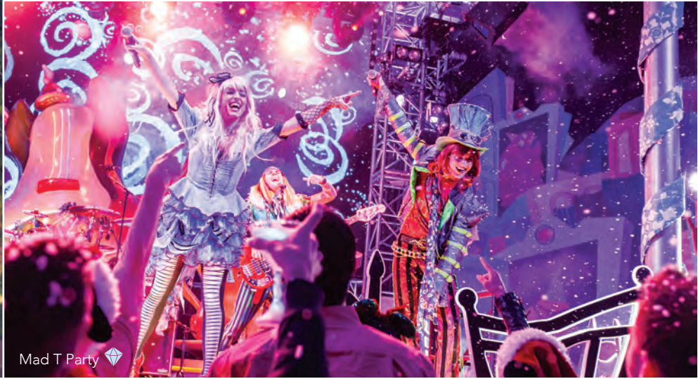
Mad T Party ◆