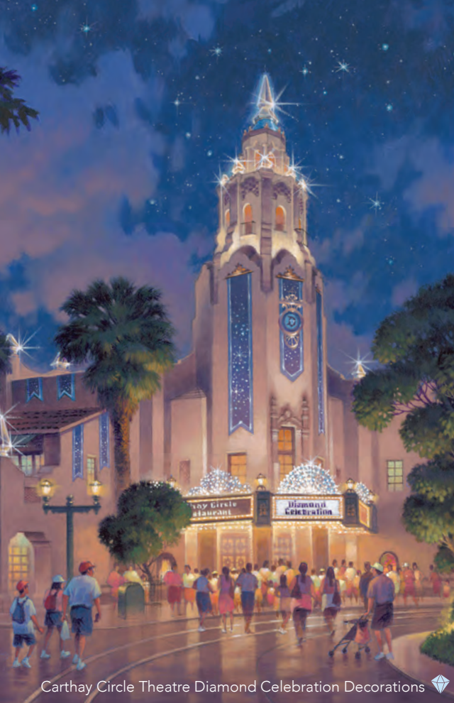
Carthy Circle Theatre Diamond Celebration Decorations ◆