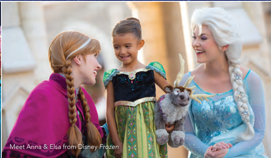
Meet Anna & Elsa from Disney Frozen