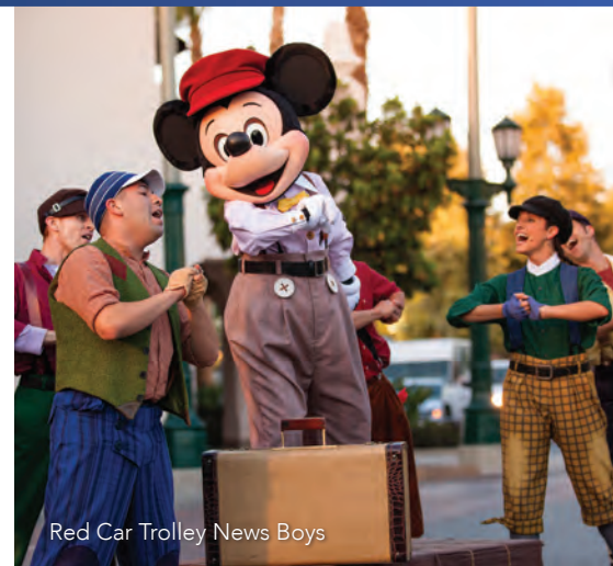
Red Car Trolley News Boys

Shop at over 25 unique venues including the World of Disney ® store, followed by a Cajun feast and live music at Ralph Brennan's Jazz Kitchen®.