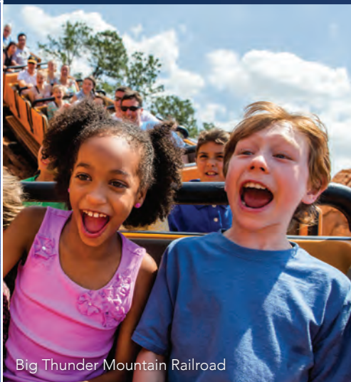
Big Thunder Mountain Railroad