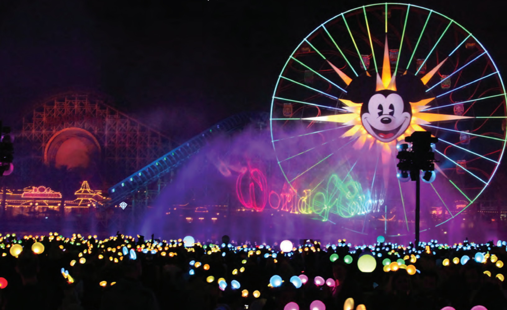
World of Color: Celebrate! The Wonderful World of Walt Disney ◆