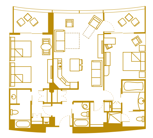
Typical 2-Bedroom Villa , 1,152 sq. ft. Accommodates up to nine Guests plus one child under age 3 in a crib.