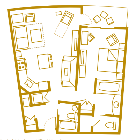
Typical 1-Bedroom Villa , 803 sq. ft. Accommodates up to five Guests plus one child under age 3 in a crib.