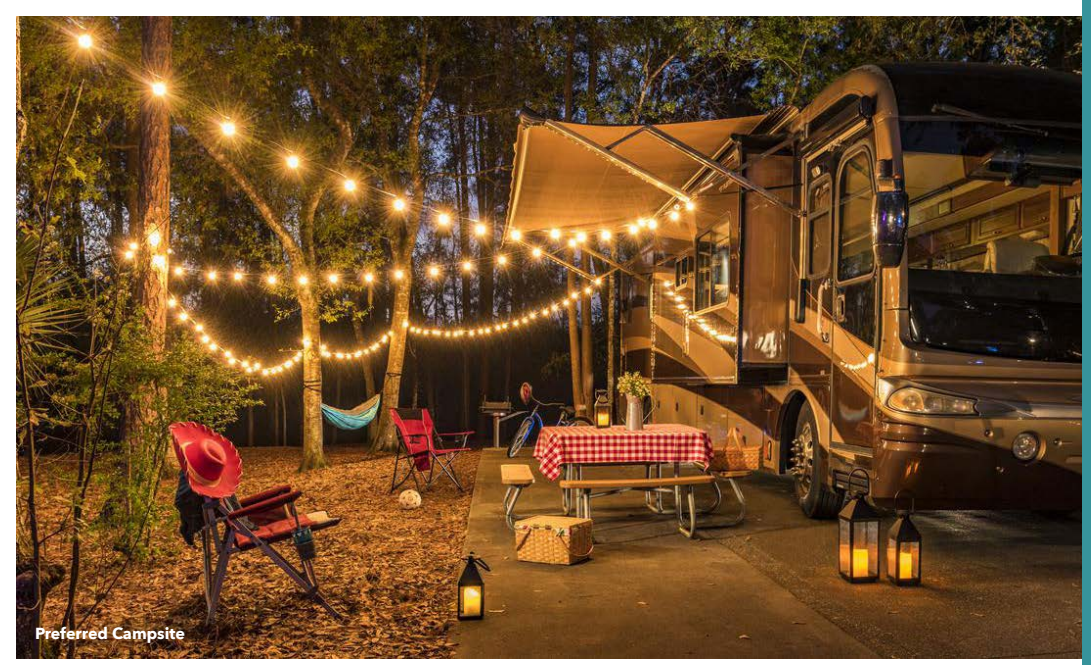
The Campsites at Disney's Fort Wilderness Resort

Tent or Pop-up campsite , accommodate up to ten Guests with 1 pop-up van or pop-up trailer and up to 2 tents.